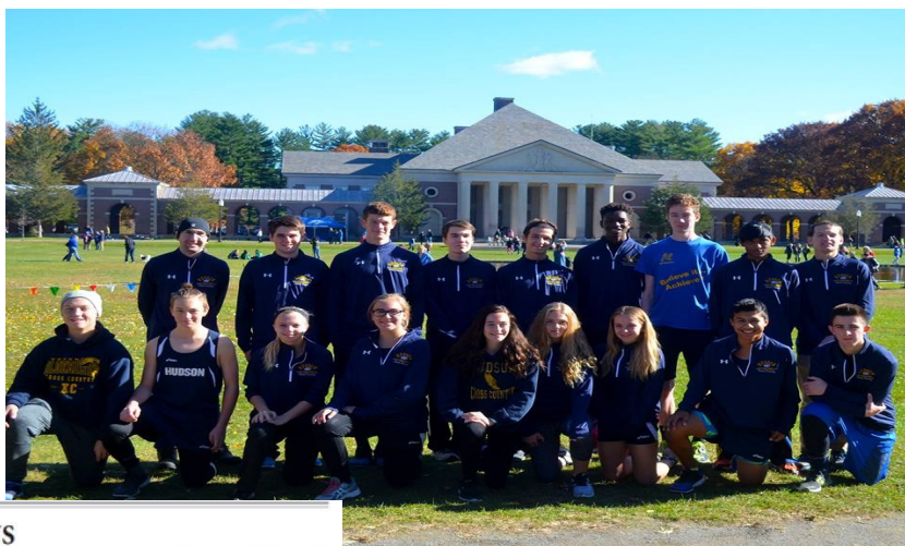
HUDSON BLUEHAWKS CELEBRATE FALL SEASONS